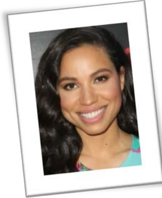
JURNEE SMOLLETT $150K TWITTER FOLLOWERS