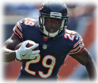
TARIK COHEN $62K TWITTER FOLLOWERS