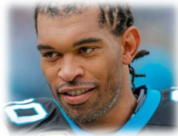
JULIUS PEPPERS $17K TWITTER FOLLOWERS