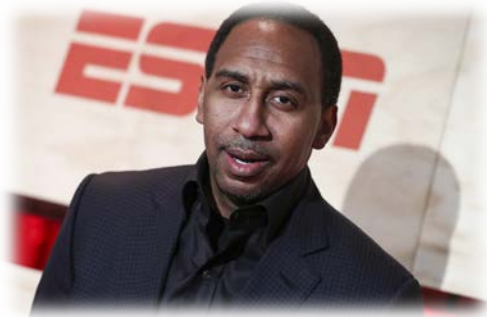
STEVEN A. SMITH $3.8M TWITTER FOLLOWERS