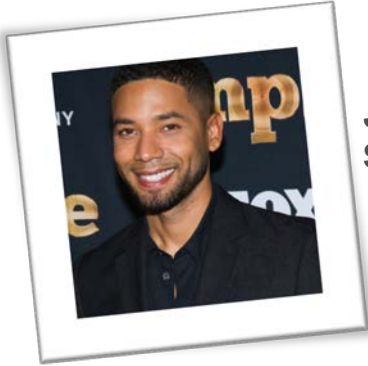
JUSSIE SMOLLETT $4.5M TWITTER FOLLOWERS